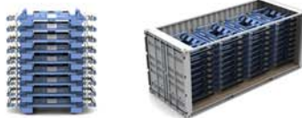
- Stackable Design (9 level x 4 row = 36 stacks in 20'DV)