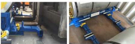
- Extension beam for 3 or 4 coils