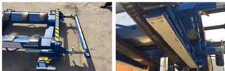
- Rubber Cushion & Sliding Pad