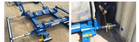
- Side Support Beam