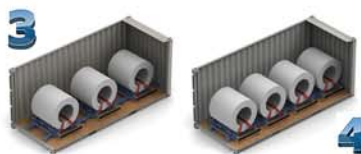
- Loading in 20' Dry Van